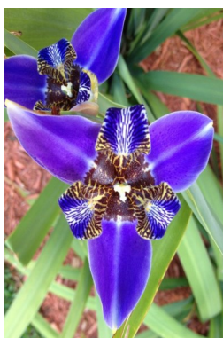
A flower on Venetian property!

Delivery services will leave packages at residents doors from time to time. Please do not touch these unless they belong to you. Remember, thieves always get caught.